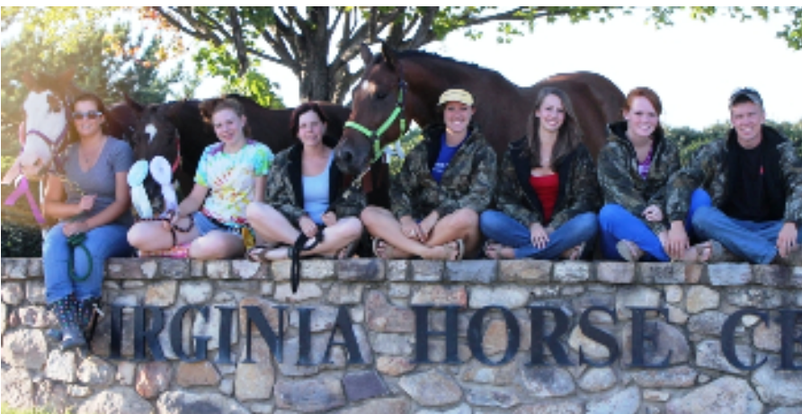
Members of the Powhatan Mustangs 4-H Club during State 4-H Horse Show.