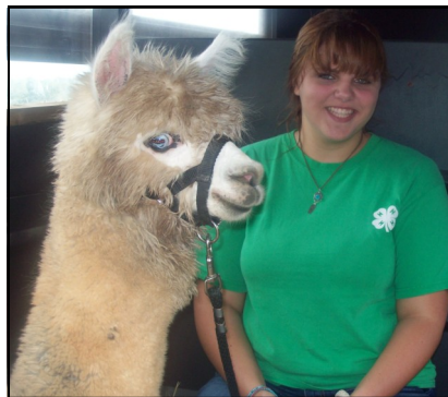
Crazy 4 Critters members volunteered their time to work with alpacas during a fall open house at a local farm.