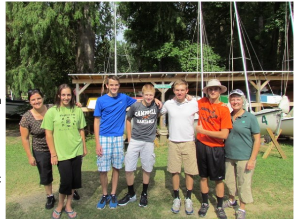
Members of the Powhatan 4-H Outdoors Club dry off after a sailing lesson at Jamestown 4-H Center.