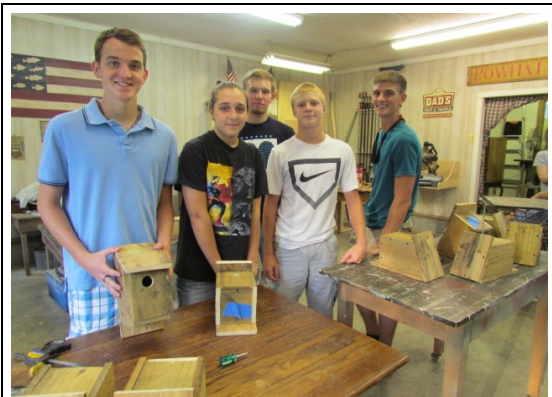
When they weren't traveling, the club built bird houses for Powhatan's State Park.