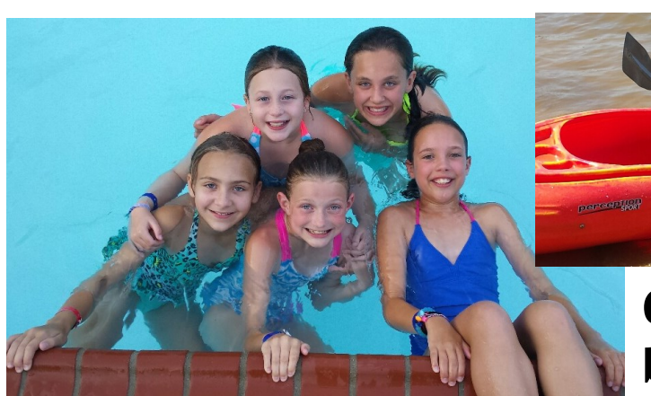
A total of 175 4-H campers from Powhatan, Goochland and Hanover spent a week at the Jamestown 4-H Center in July.