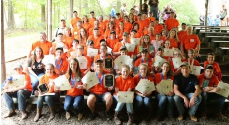
Powhatan 4-H Shooting Club members (above) took top honors in the Hunter Education Challenge in May. First and third place overall team champion plaques came home with two different teams from the local club. Numerous individual awards were also won. The competition was held at Holiday Lake 4-H Center in Appomattox.