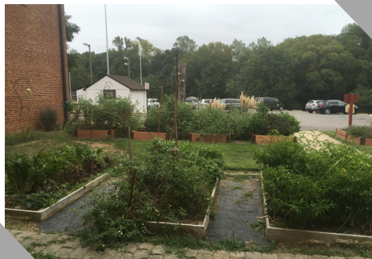
They garden has produced well this year!

Facebook: Virginia Cooperative Extension—Powhatan http://offices.ext.vt.edu/powhatan/