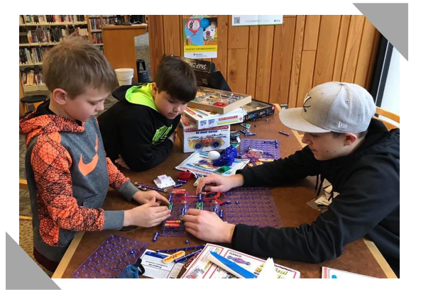
Participants at the Powhatan Maker Fest on Saturday, February 23

<u>Facebook</u>: Virginia Cooperative Extension—Powhatan http://offices.ext.vt.edu/powhatan/