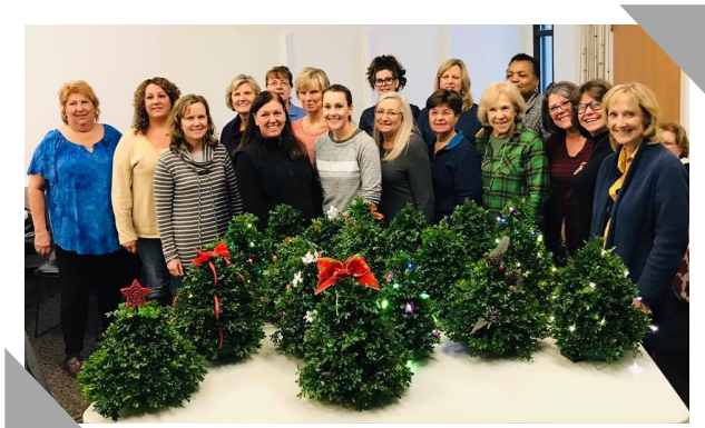
Participants in the Holiday Greenery Workshop held at the Powhatan Library, taught by Master Gardeners on Saturday, December 1

Wishing you a happy holiday season from all of us at the Powhatan Extension office! Thank you all for an amazing year, we are looking forward another great one in 2019!